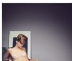
HONG KONG 15/16 MARCH 2016