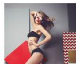
SHANGHAI 12/13 OCT. 2016