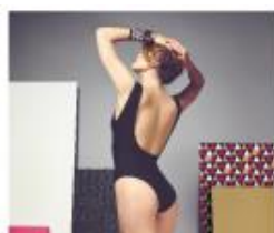
LYON 9/10/11 JULY 2016