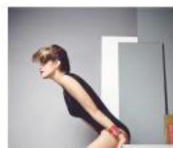
NEW YORK SEPT. 2016